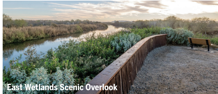
East Wetlands Scenic Overlook