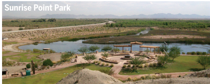
Sunrise Point Park