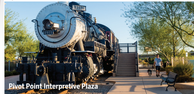
Pivot Point Interpretive Plaza