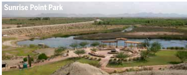
Sunrise Point Park