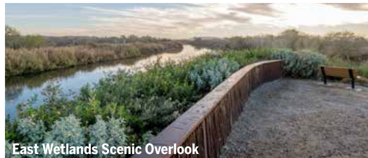
East Wetlands Scenic Overlook