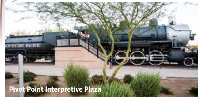
Pivot Point Interpretive Plaza